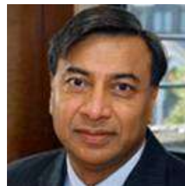
Lakshmi Mittal, the Indian Deripaska

The company Mittal Steel Zenica bought over the RZR Ljubija, a complex of mines with great reserves of iron ore. We should mention that the Russian state companies Juzuralzoloto and Zarubeznjev are also present. The former has become a strategic partner of the mining plant Sase in Srebrenica and the latter has bought over the oil refineries (Modrica, Petrol). Thus, any further penetration of MOL and Mittal has been prevented.