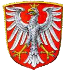
The coat of arms of th